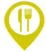
Free School Meals and Uniform Allowance

The FSMU Helpdesk is available from Monday to Friday 9am to 4pm by telephone on 028 9047 0233 or email mealsanduniform@eani.org.uk