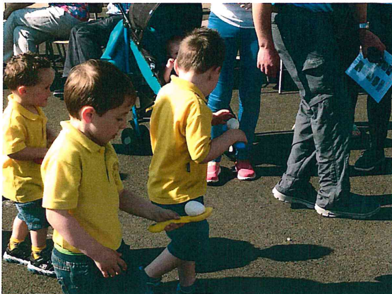
After School Clubs w/c Monday 5 th June

Our Nursery children had their 'Fun Day' last Thursday! The weather was fabulous and a great time was had by all! At this time of year we begin our formal transition arrangements for children entering Primary 1 in September. This year our Induction Day will be on Monday 5 th June. This is an opportunity for parent: and children to come into Buick to meet with staff and find out more about Primary 1. We look forward to seeing our new pupils next week!