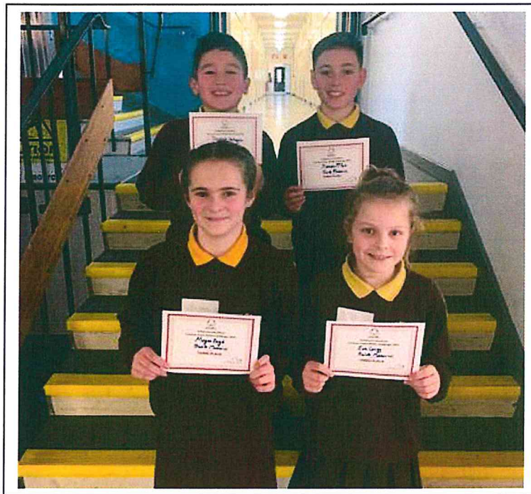
After School Clubs w/c Monday 3 rd February 2020